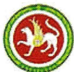
Tatarstan Regional Government