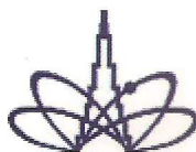
Kazan Scientific Center